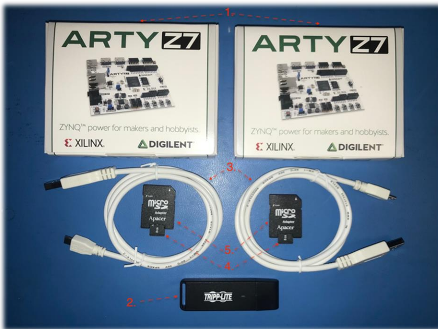
Figure 2. Hardware components that were provided for all teams

MITRE will provide each team with a set of hardware and peripherals required for the competition. Teams may choose to obtain additional units of the hardware to increase testing and attack development capabilities for their team. However, your system must work with the hardware that was provided. Switching to a different platform or modifying the physical hardware during the design phase is not allowed.